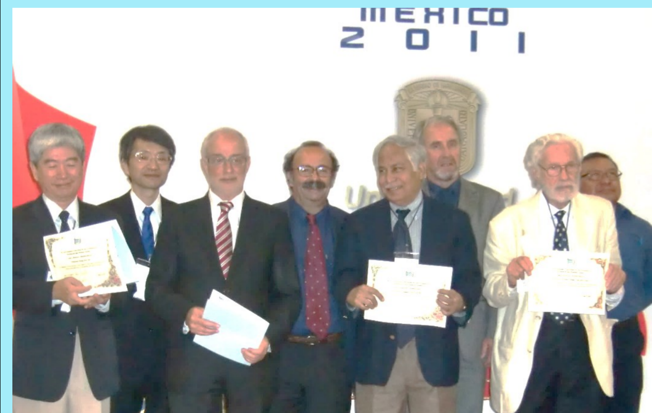
2011 IFTToMM honorary members with the IFTToMM President